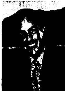
MICHAEL R. SHAPRAY LAW CORPORATION

WITH OFFICES IN VANCOUVER AND SURREY, BRITISH COLUMBIA.